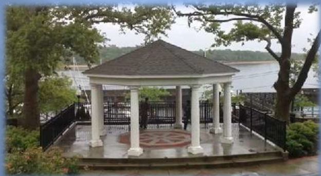
The Gazebo at Bayview Park