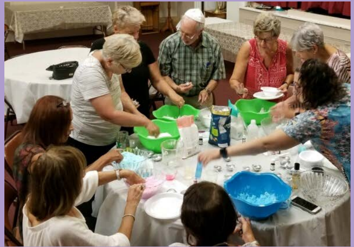
Filling the molds